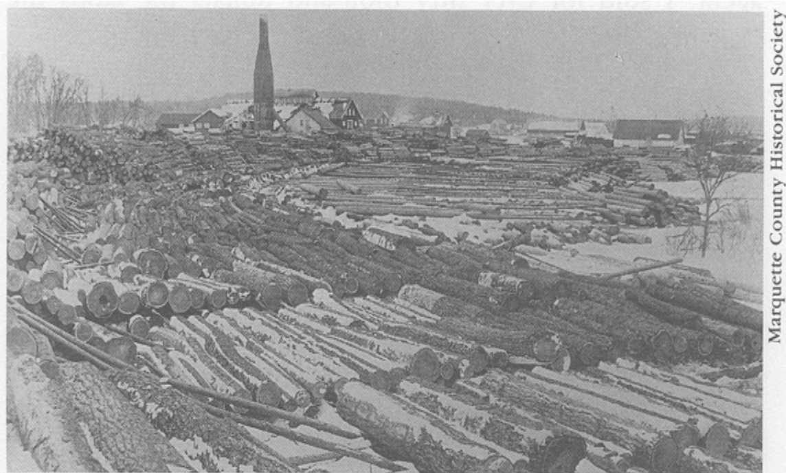
Marquette County Historical Society