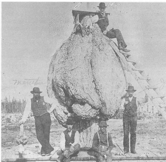
Giant birch burl used as flagpole base in Dollarville, c. 1890's.

The sun was shining gloriously. The leaping, roaring water flashed and sparkled and gleamed as it pitched over the ledge and dropped out of sight in its own mist and spray. Far below me the brown logs circled endlessly, the gorge lay like a great gash in the green woods, flooded with the white, foam-covered water. The man on the brink seemed posing for a sculptor, now standing erect on the outermost log, now stepping back and bracing himself as he hauled in on the line. The foreman passed up and down, using the pile as a stairway between the upper rapids and the whirlpool, and the three men went about their business quietly and deliberately—neither reckless nor anxious—as if in such a place as