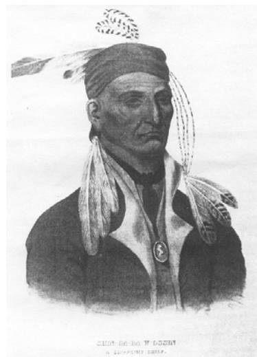
Photo 1.—Portrait of Chief Shingabawossin (Taylor 1991).

The Tahquamenon area retained much of its solitude into the 1830s. Access to the river was always poor, as extensive marshes made walking to open water very difficult in all but a few rare spots. From the 1830s into the 1860s, however, the native trails gradually became broader and more defined by increased European traffic (Taylor 1991). Even so, Europeans were not attracted by the land as much as by the timber. In late 1800s, many loggers and lumbermen used the river in one way or another to assist in the promotion of their fortunes or ill fortunes (Anderson 1982). Many local names refer to the loggers of that time.