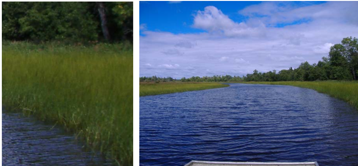
Photo 8.—Wild rice in the Tahquamenon River near the Sage River confluence, July 2005

There is precedent for walleye to spawn in flooded marshes. Becker (1983) and Priegel (1970) described walleye use of flooded marsh areas adjacent to the Wolf and Fox rivers. These tributaries to Lake Winnebago watered 13 major spawning marshes located 33–97 mi upstream from the lake. One of the most significant environmental characteristics was the presence of inlets and outlets which provided continuous water flow over the marsh areas during the period of high water levels. Flowing water provided good aeration of the eggs and an escape route of walleye fry to the river. A significant vegetative change has occurred on the Tahquamenon River from Dollarville Flooding downstream to immediately upstream from the Hendrie River. However, the most striking change is located between the mouths of the Auger and Hendrie rivers. Open water channel width has recently been halved by