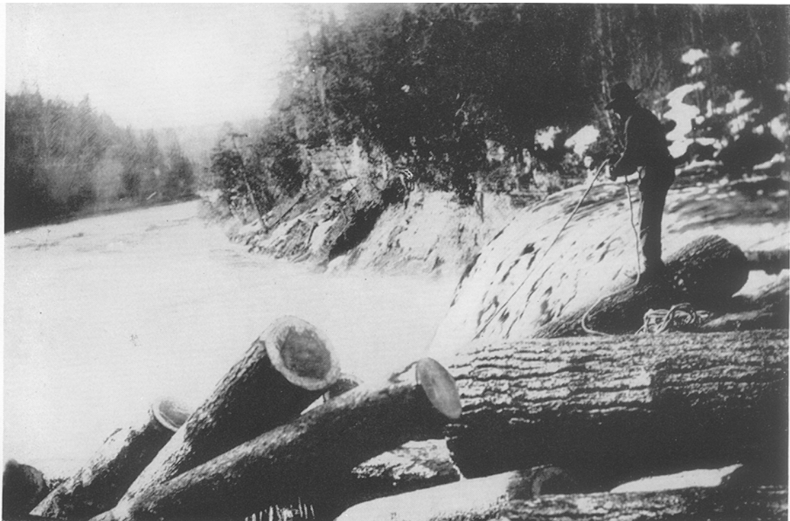
Photo 4b.—Upper Falls logjam, 1904