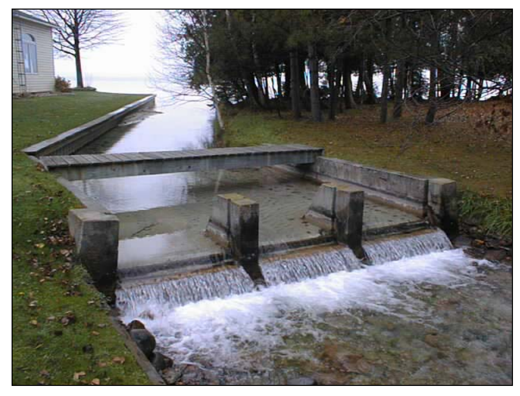
Tressler Dam (North Manistique Lake) at low flow with all boards removed.

Nine dams are located in the upper mainstem. Six are in private ownership, one is county owned, one is owned by the MDNR, and ownership of the ninth is unknown. Since the early 1940s, three dams have been installed on the Manistique Lakes system to elevate water levels for summer-boating (Portage Creek, Tressler, and Manistique Lake dams). The water level is normally raised for summer months to accommodate boating, and lowered in winter months to alleviate shoreline ice scouring and damage to recreational docks. In recent years, property owners have requested higher summer-time water levels to accommodate larger sized boats. South Manistique and North Manistique lakes each have their own water control structure and are operated independently. These two lakes drain into centrally located Big Manistique Lake.