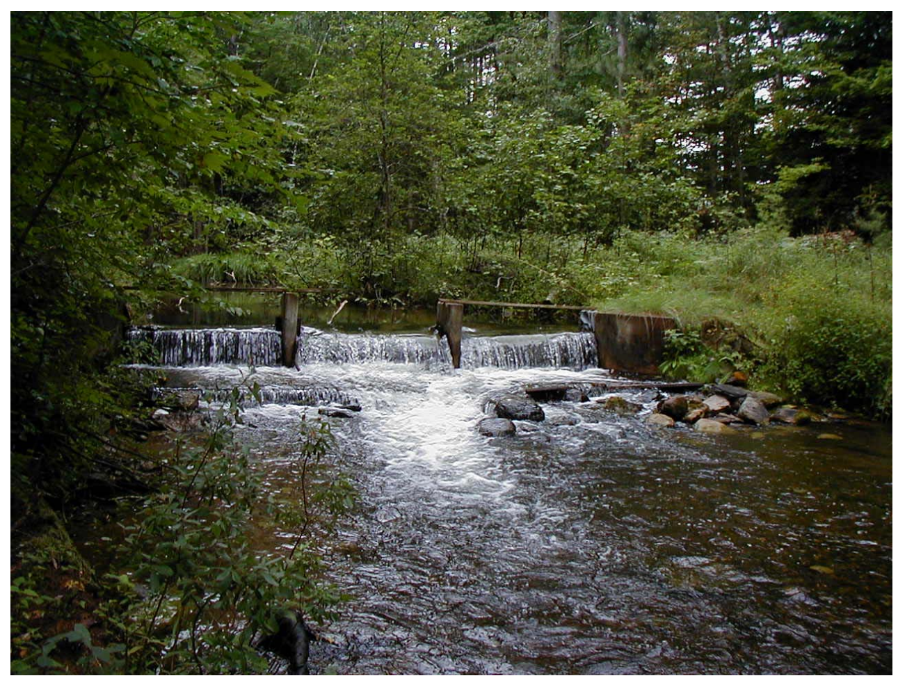
Carr Creek fish barrier dam.

Bear Lake Barrier is owned by MDNR and is located on USFS land, and is not listed with MDEQ. It serves as a fish barrier and blocks non-trout species from migrating upstream into Bear Lake, which is presently managed and stocked with trout. This is a wooden barrier constructed with tongue and groove 2 inch by 6 inch lumber, jetted vertically into the streambed. Water has periodically eroded the abutments to this structure which has necessitated occasional repairs.