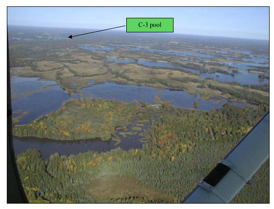
Seney ponds, Seney National Wildlife Refuge.

The C-3 pool in the northern portion of the Seney Refuge collects water from North Marsh Creek and Walsh Creek. Two water control-structures exist on the C-3 pool. The western most water control structure provides water to the lower portion of Marsh Creek, while the eastern most structure provides water to the marsh complex south of the C-3 pool.