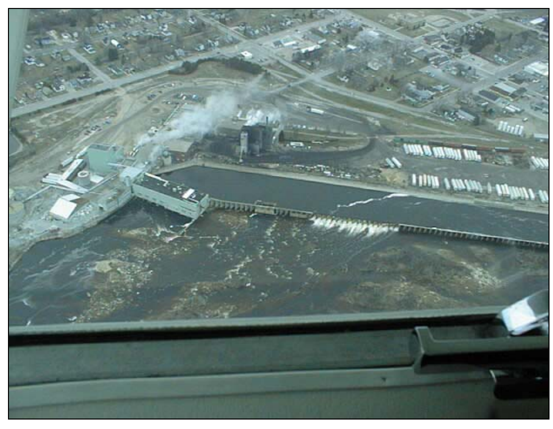
Downstream View of MPI Dam