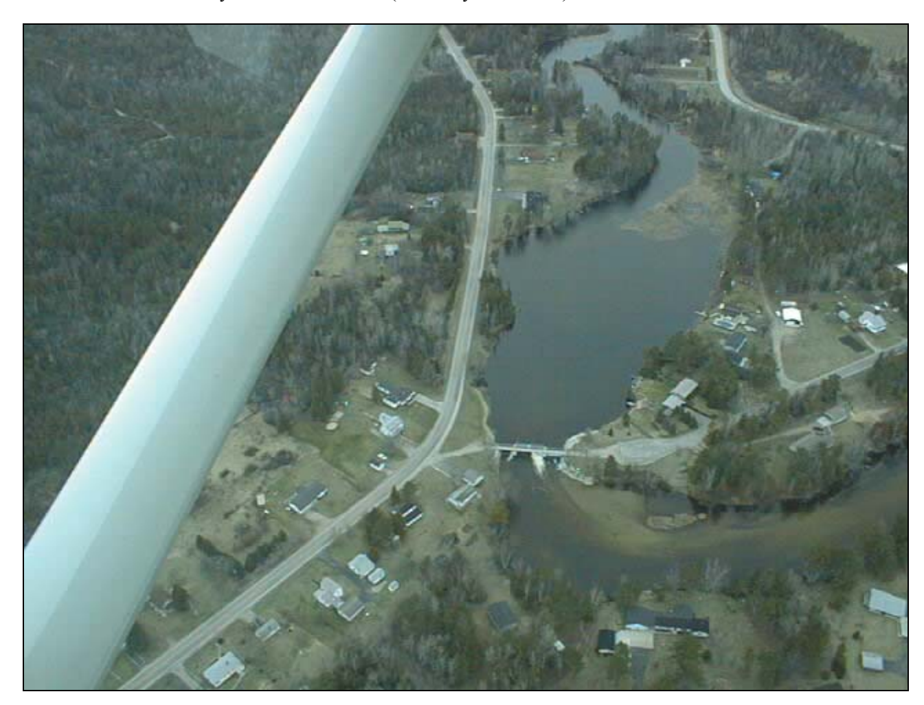
Indian Lake Dam

Indian River that has a controlled spillway that allows for manipulation of water levels. Elevation of dam has increased the base level of Indian Lake and consequently reduced water velocity in the Indian River immediately above Indian Lake (Benchley et al. 1993).