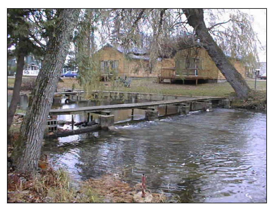
Portage Creek Dam (South Manistique Lake) at low flow with all stop boards removed.

Tressler Dam controls water levels of North Manistique Lake and is located on Helmer Creek which is the outlet stream located along the southeast shore. This dam is situated in the back yard lot of a private residence. In 1948 the first lake-level control was placed at this location with upgrades and improvements made to the dam during recent years. The dam's purpose is to raise the North Manistique Lake level to facilitate recreational boating. Boards are removed from the dam each year in early October to lower water levels and to prevent winter shoreline ice scouring. After spring icemelt, boards are replaced in the dam to raise the water approximately 2.5 ft above the level of Helmer Creek.