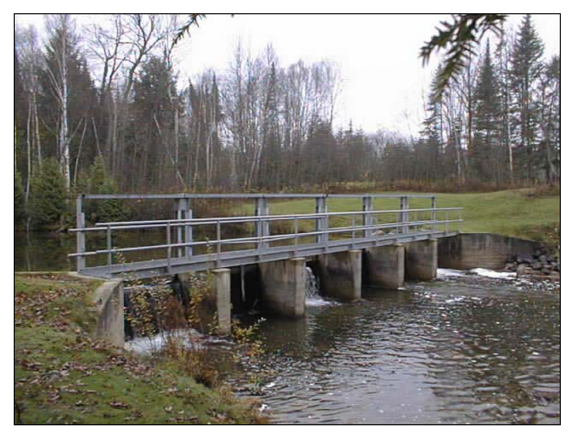
Manistique Lake Dam

The Manistique Lake dam is located approximately 4 miles downstream from Big Manistique Lake and is situated just west of the 10-Curves Road (County Road 498). This dam's purpose is to maintain lake water levels that accommodate summer boating. In 1948, the first lake-regulating dam was built. The present structure was constructed in 1985. The dam is set to maintain a legal lake level on Big Manistique Lake at 686.0 ft above mean sea level. A Luce County appointee is responsible for operation of this dam. Operation of the dam occurs with approximately 2.8 ft of stop boards being put in place anytime between early April and mid July, depending on spring rains and snow-melt. The stop-boards are removed in late fall before ice up occurs. Often, during fall draw down, all boards are removed at one interval, which creates a peaking-flush flow. Downstream of the dam, the stream banks show evidence of scouring attributable to peaking-flush flows.