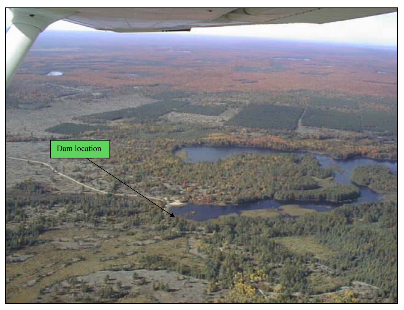
Stanley Lake with dam at outlet.