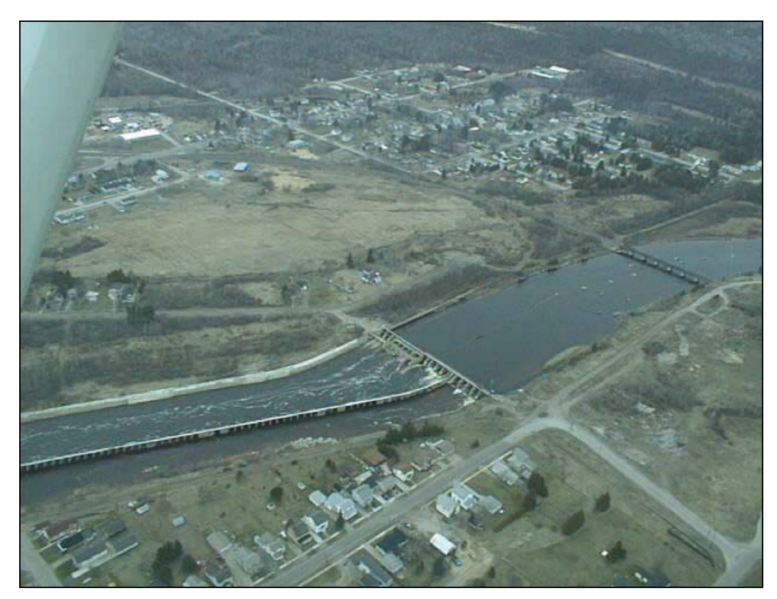
Upstream View of MPI Dam

The dam within this subwatershed, Paper Mill Dam, was constructed in 1919. This dam was originally designed for hydroelectric generation purposes but was decommissioned in summer 1991. The Paper Mill Dam is the first dam upstream from the mouth of the river and impedes Great Lakes and aquatic nuisance fish species movement up the river. In recent years, leaks in the dam have allowed sea lamprey to pass and gain access to spawning habitat upstream (see <u>sea lamprey</u>). With 22 ft of head, Paper Mill Dam is the only dam on the watershed with a hazard rating classification of 1.