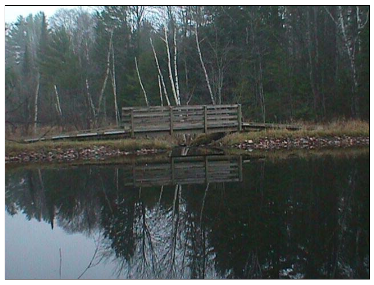
Council Lake Dam

Six dams are located in the Tributaries-upper Indian River subwatershed. Four dams are registered with MDEQ; United States Department of Agriculture (USDA), Hiawatha National Forest owns three; and one dam is privately owned. These four registered dams are in place to maintain water levels of impoundments. The Council Lake and Kettlehole Pond dams are in federal ownership and are not registered with MDEQ. The Council Lake dam maintains the water level in a complex of four lakes known as Council, Redjack, Scout, and Lion lakes.